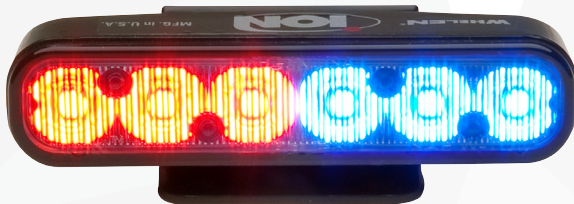
WIONJ Universal mount