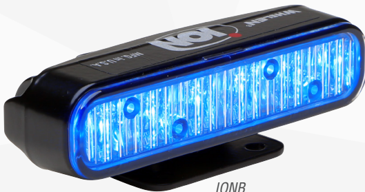
IONB Universal mount