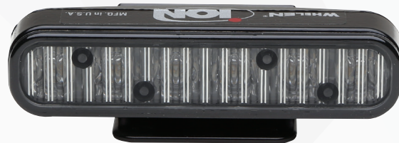
ION Smoked lens